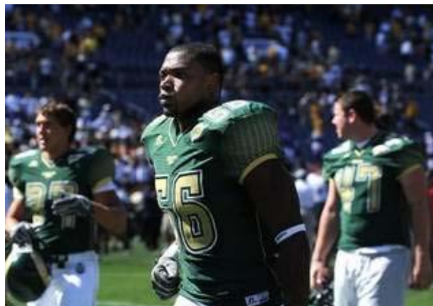
Purchase this Photo

> NEXT UP - CSU is on the road for its next two games, traveling to Reno to play Nevada at 8:30 p. m. Saturday and to Oxford, Ohio, for a Sept. 18 game against Miami (Ohio).